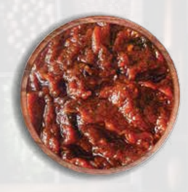
GINGER PICKLE WITH GARLIC / WITHOUT GARLIC