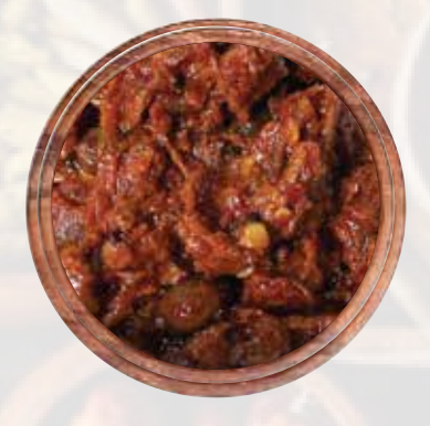
CHINKAYA PICKLE WITH GARLIC/WITHOUT GARLIC