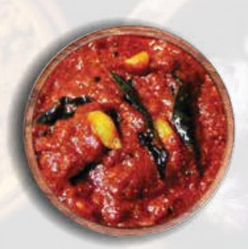
TOMATO PICKLE WITH GARLIC / WITHOUT GARLIC