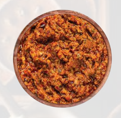
CHINTAKAYA THOKKU PICKLE