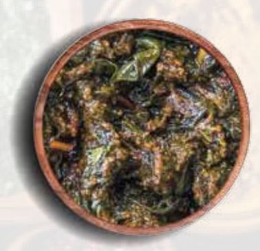
GONGURA PICKLE WITH GARLIC / WITHOUT GARLIC