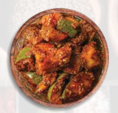
MANGO PICKLE WITH GARLIC / WITHOUT GARLIC

Keats Veg Pickle delivers a tangy burst of flavor with crisp vegetables and a blend of traditional spices for an authentic taste.