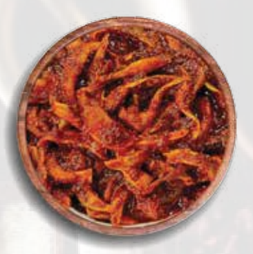
DRIED MANGO PICKLE