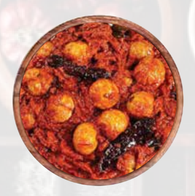
AMLA PICKLE WITH GARLIC / WITHOUT GARLIC