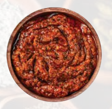
AMLA THOKKU PICKLE