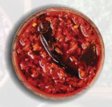
RED CHILLI PICKLE WITH GARLIC / WITHOUT GARLIC